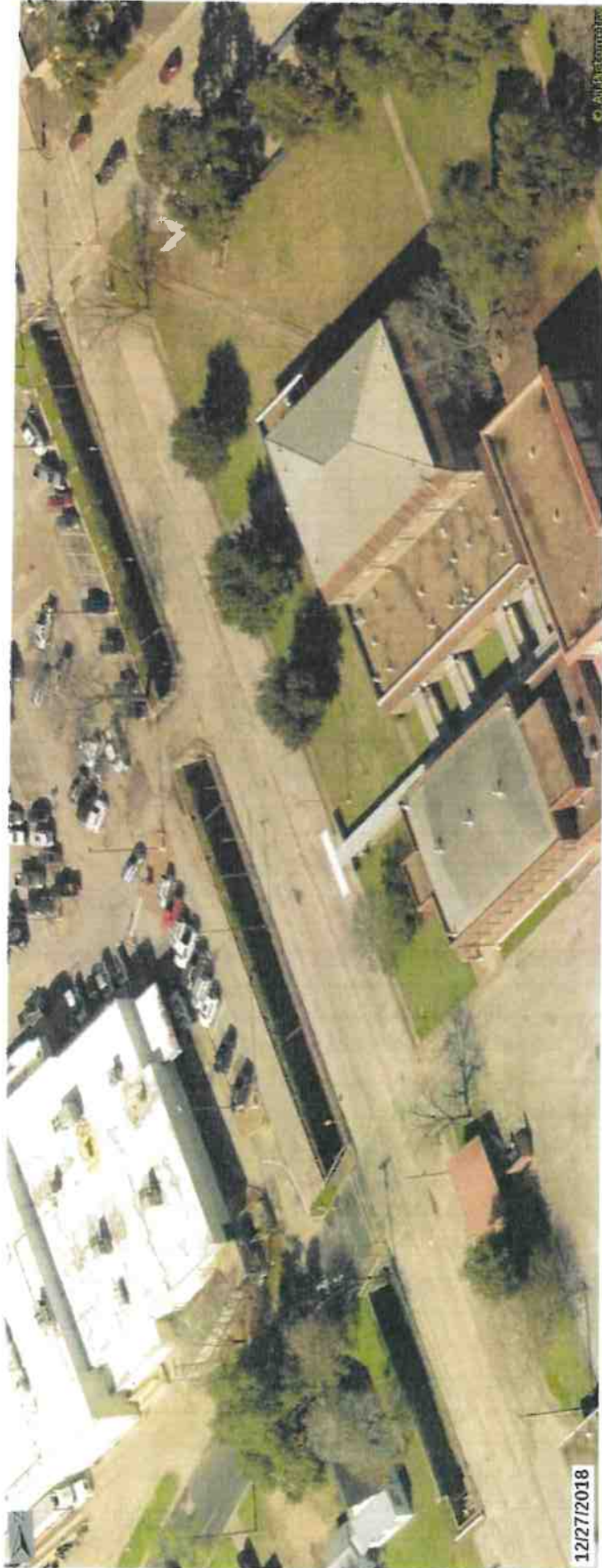
Beef Head Ditch